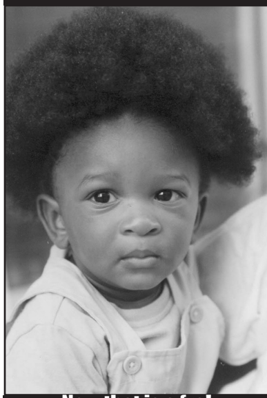
Now that is a fro!